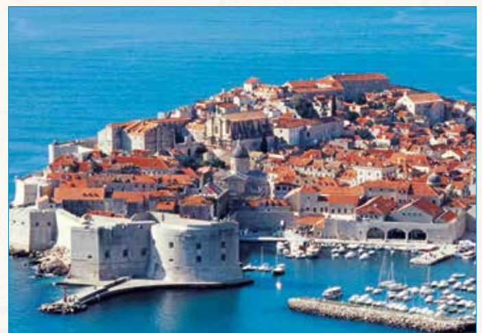
Explore Dubrovnik's impressive, well-preserved Renaissance and Gothic architecture, encircled by its original 15 th -century walls.