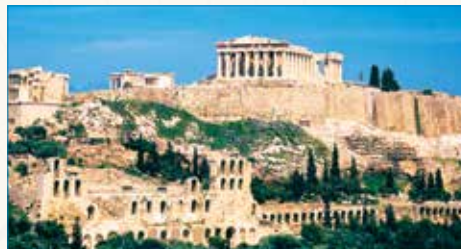
ATHENS POST-CRUISE OPTION

The Travel Program outlined here is subject to the features, final pricing and terms and conditions set forth in the published Travel Program brochure. Upon receipt of the published Travel Program brochure, you will be given 10 days to reconfirm your reservation, at which time any deposit(s) will become subject to cancellation fees.