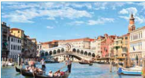
VENICE PRE-CRUISE OPTION