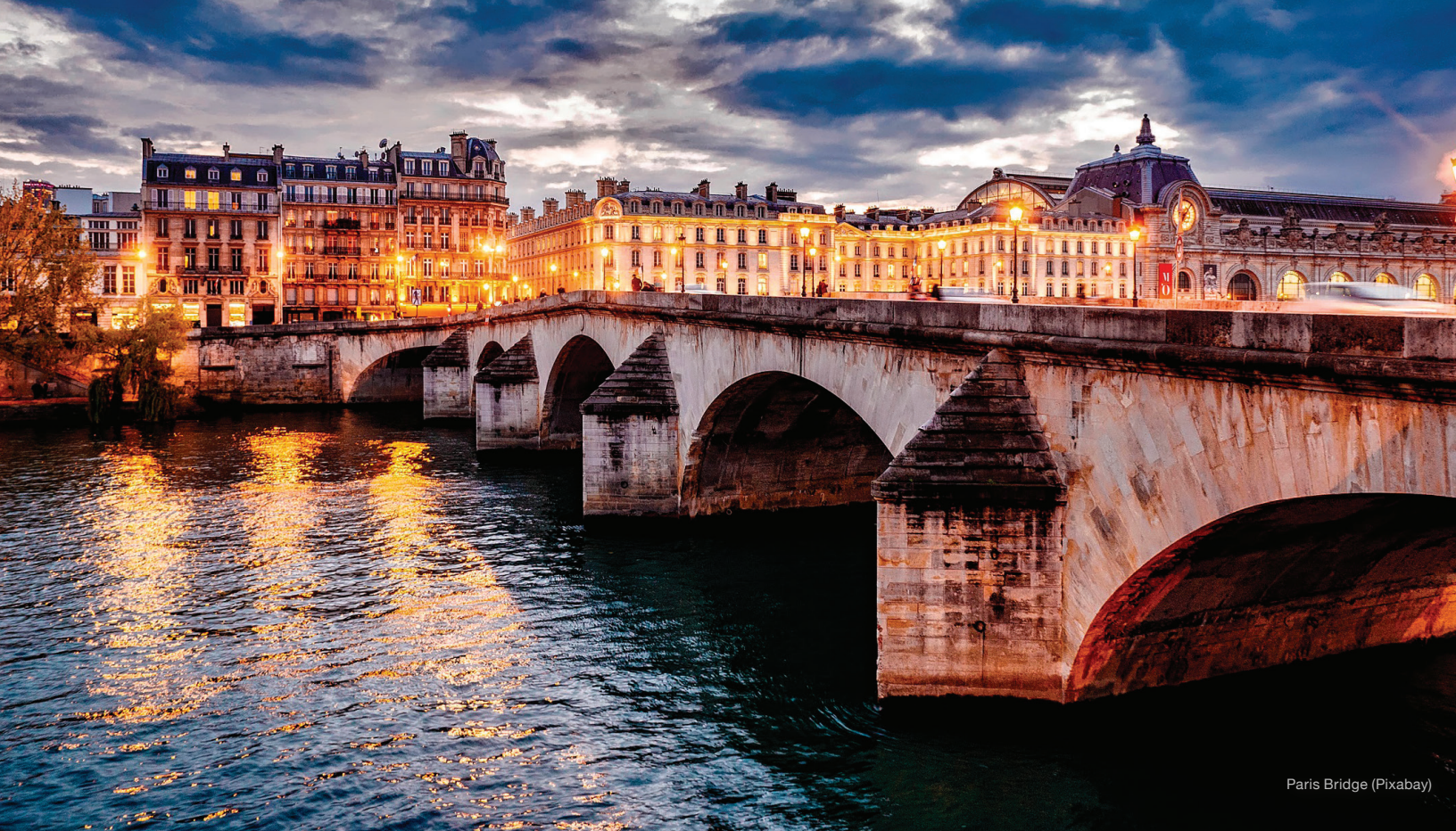
Paris Bridge