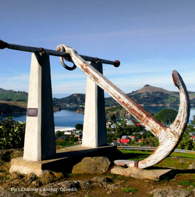
Port Chalmers Anchor, Dunedin