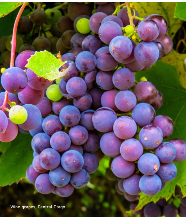
Wine grapes, Central Otago

An airport transfer is included this morning to carry you to Queenstown airport for flights back to the United States. (Breakfast)