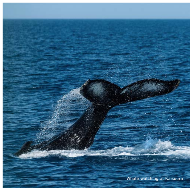
Whale watching at Kaikoura

Sudima Christchurch City (Breakfast, Lunch)