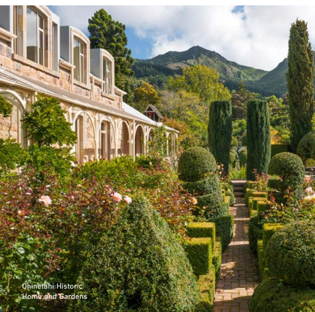
Ohinetahi Historic Home and Gardens