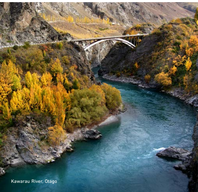
Kawarau River, Otago